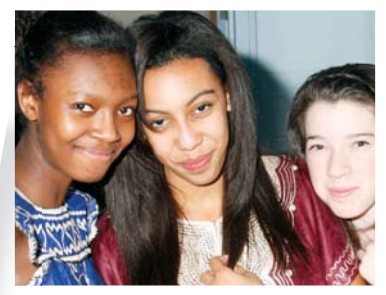
Celebrating Black History Month at Saint Andrew's United Church – Taste of Africa 2011