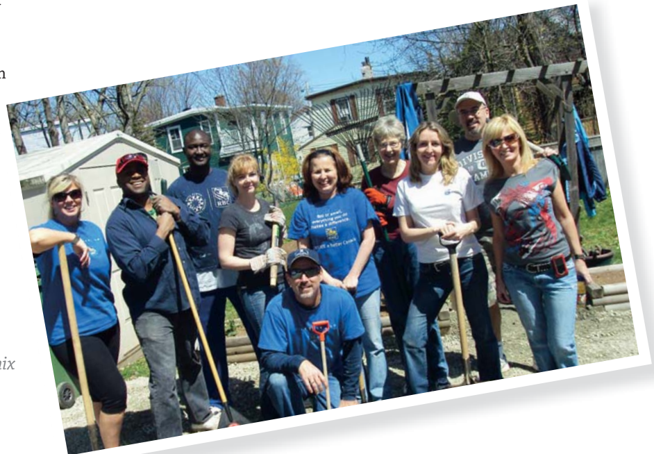
RBC volunteers at Phoenix

Anglican Baptist Christian Church of Disciples Disciples of Christ Lutheran Presbyterian Roman Catholic United