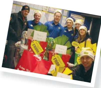
Best Buy Viewpoint Committee holiday donations