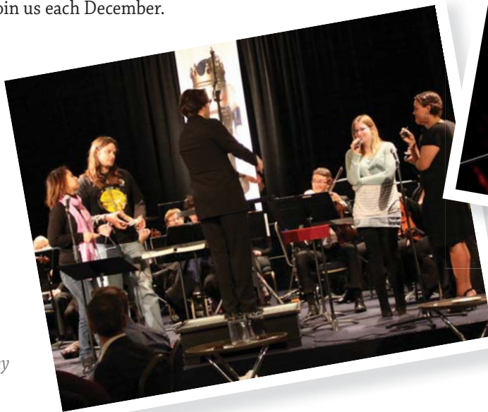
Phoenix youth performing with Symphony Nova Scotia

“I feel that I would not be where I am today without the help and support of Phoenix. They do so much for me and other youth. We are lucky to have people who care about us, including the staff and all of you – thank you.”