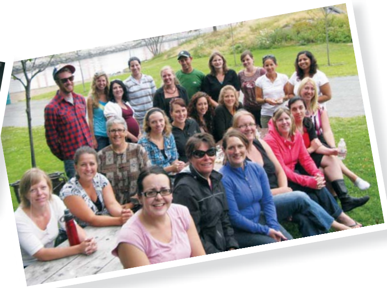
We employ 75 staff, including full time, part time and relief